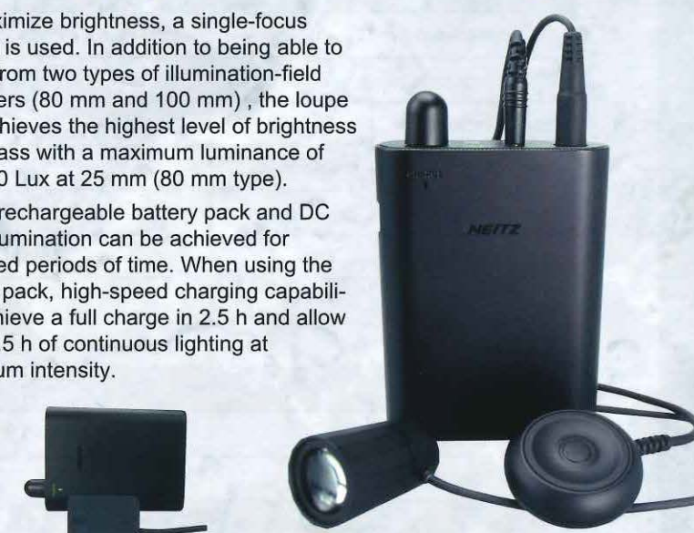
Stand and AC Adaptor for NSI-X