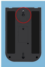
Wall nail hanging hole fixed