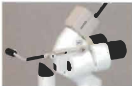
Main unit with video adapter