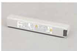
Spare Lithium Ion battery pack