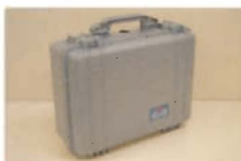
Carrying trunk case

Specifications and appearances are subject to change without notice.