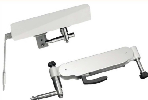
Phoropter arm PA-1000 and PA-2000 (optional)