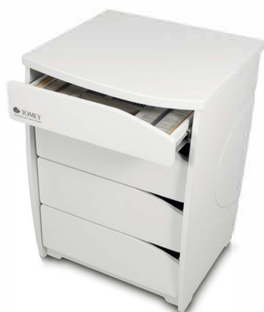
Trial lens cabinet TC-1000 (optional)