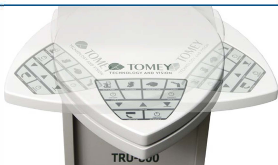
Rotatable control board panel

Perfect if you need a tiny and clever solution for your refraction environment. Due to its much smaller size it even fits into very small rooms. It's very easy to attach all essential instruments such as a phoropter and a chart projector to the TRU-800 . If you want to store hand-held units or trial lenses – the optional trial lens cabinet TC-1000 suits perfectly.